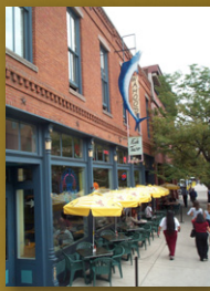
Dataworks (upper left), Pickering Automotive (bottom left) and Wahoo's Fish Taco (right).